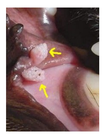
Sometimes viral papillomas take on a more cauliflower-like shape.

By far, the most common type of viral papilloma in the dog is the oral papilloma, caused by CPV1 (canine papilloma virus-1). Viral papillomas are classically "fimbriated," meaning they are round but often have a rough, almost jagged surface reminiscent of a sea anemone or a cauliflower. They occur usually on the lips and muzzle of a young dog (usually less than 2 years of age). Less commonly, papillomas can occur on the eyelids and even the surface of the eye or between the toes. Usually they occur in groups rather than as solitary growths so if one growth is noted, check inside the mouth and lips for more.