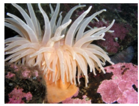
The "fingers" of the sea anemone are its "fimbriae." It is easy to see why the papilloma is said to resemble this sea creature.

When the viral papilloma has a classic appearance like the ones shown above, biopsy is usually not needed to identify the growth. In cases where there is ambiguity, however, biopsy will settle any questions. The good news, as we will review, is that most oral viral papilloma cases are mild and resolve on their own within 2 months.