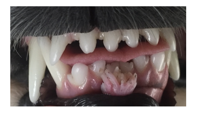
A "fimbriated" oral papilloma in a dog.